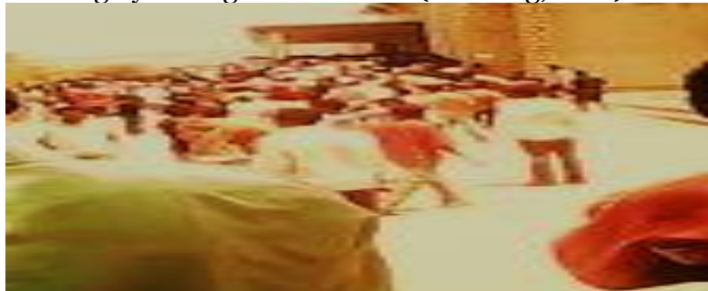
Adama University student protest: May 21, 2011 ( Read more in Afan Oromo from Qeerroo News )