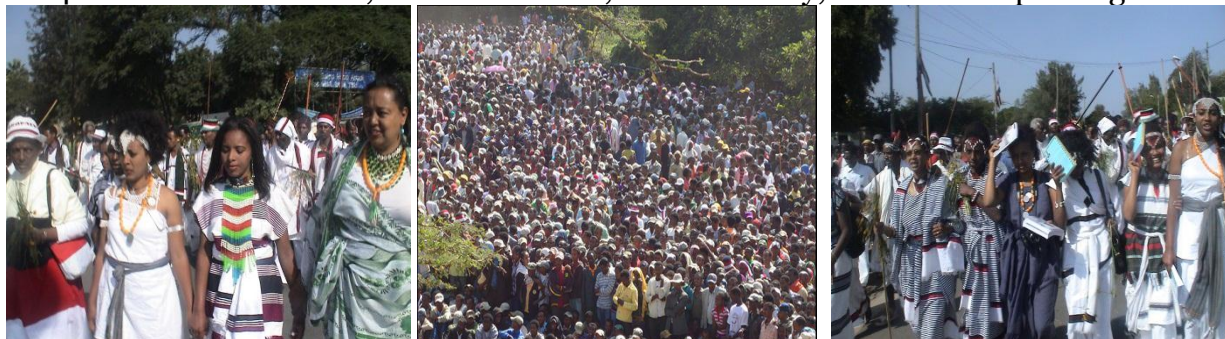
Irreechaa Celebration at Arsadi Lake, Bushoftu, October 3, 2011

(Read more in Afan Oromo from Qeerroo News)