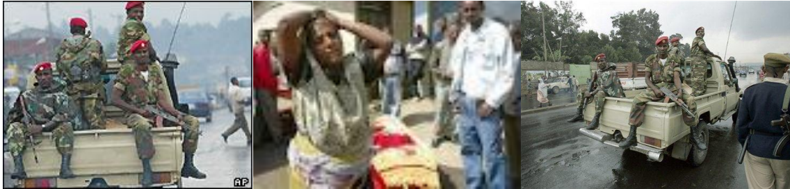
Agazi: The Death Squad of the TPLF-Ethiopian Regime

Agazi 1 force of the regime fired live ammunition on the students. One student was severely wounded by a bullet.